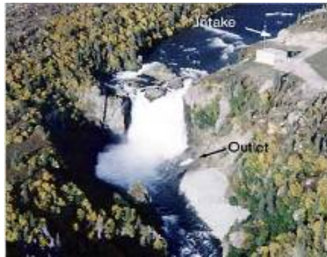
Small Hydropower ( <30\text{MW} )