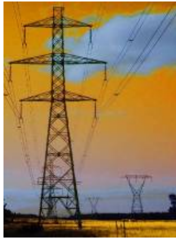
Efficient Electric Delivery