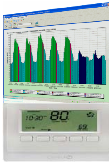
Managed Electric Demand