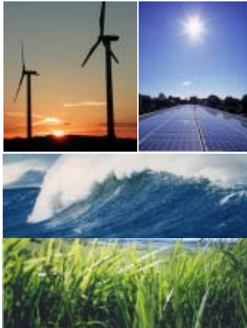
Renewable Electric Generation

A smart grid has the potential to facilitate the move toward the low carbon economy